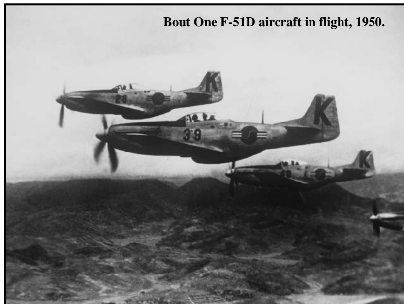
Bout One F-51D aircraft in flight, 1950.